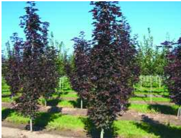
Crimson Sentry Maple

ZONE: 3 | HEIGHT: 45' | SPREAD: 25' Caliper: 1¼" | 2" | 2½" | 3" | 3½" | 4" | 4½"