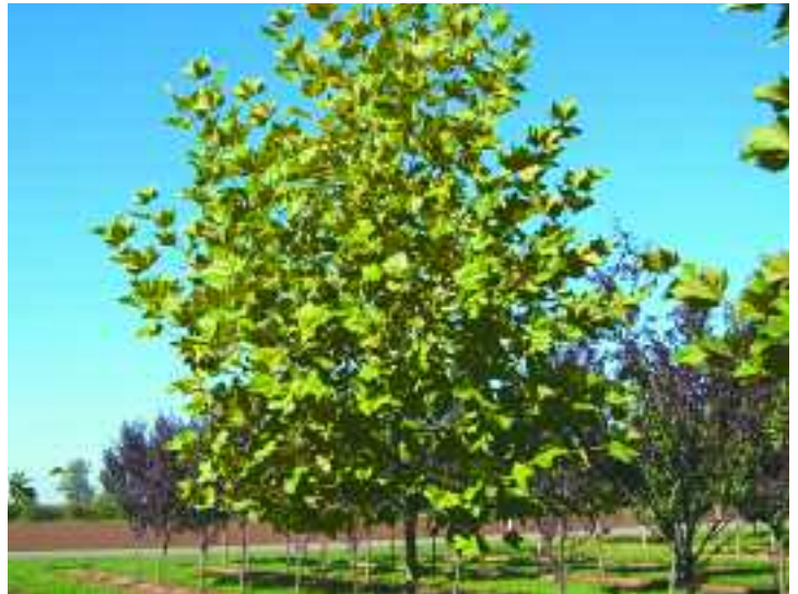
Bloodgood London Planetree

ZONE: 4 | HEIGHT: 40' | SPREAD: 35' Caliper: 1¼" | 2" | 2½" | 3" | 3½" | 4" | 4½"