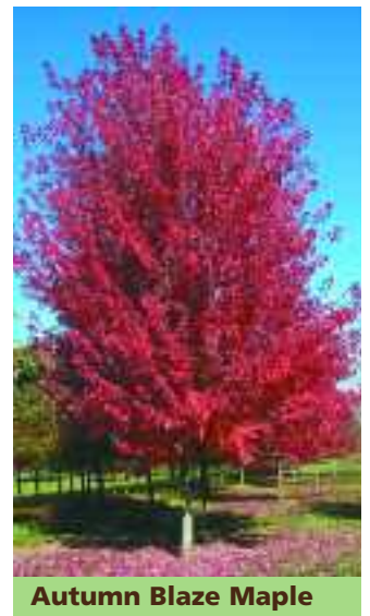
Autumn Blaze Maple

WIRE BASKETS: To remove or not. We use wire baskets on all of our trees. They function as support for the rootball. Documented field experiments have proven that tree roots simply grow around the wires and make a complete union, thereby causing no problems. When planting the trees, the rope holding the burlap around the tree must be removed. The burlap should be cut close to the wire and removed.