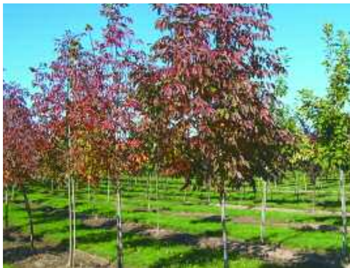
Autumn Purple Ash

ZONE: 3 | HEIGHT: 45' | SPREAD: 25' Caliper: 1¼" | 2" | 2½" | 3" | 3½" | 4" | 4½"