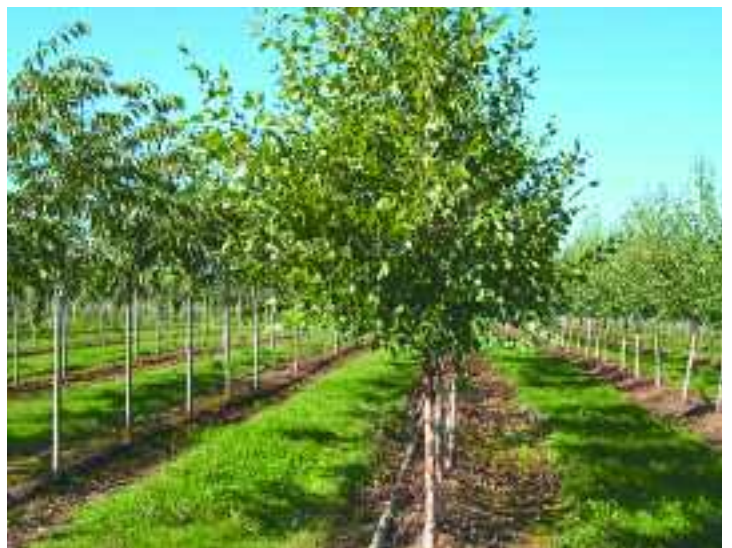
Dura Heat Birch

ZONE: 5 | HEIGHT: 40' | SPREAD: 30' Caliper: 1¼" | 2" | 2½" | 3" | 3½" | 4" | 4½"