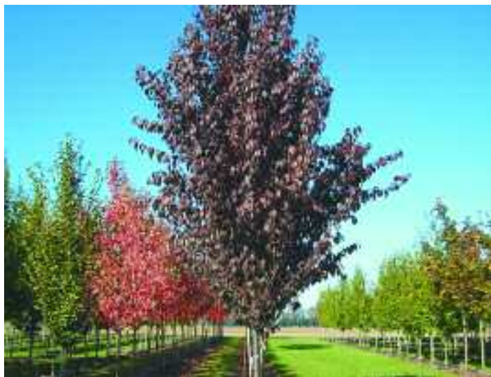
Crimson Pointe Plum

ZONE: 5 | HEIGHT: 20' | SPREAD: 15' Caliper: 1¼" | 2" | 2½" | 3" | 3½" | 4" | 4½"