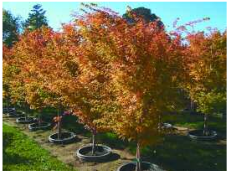
Sango Kaku Japanese Maple

Caliper: 1½" | 2" | 2½" | 3" | 3½" | 4" | 4½"