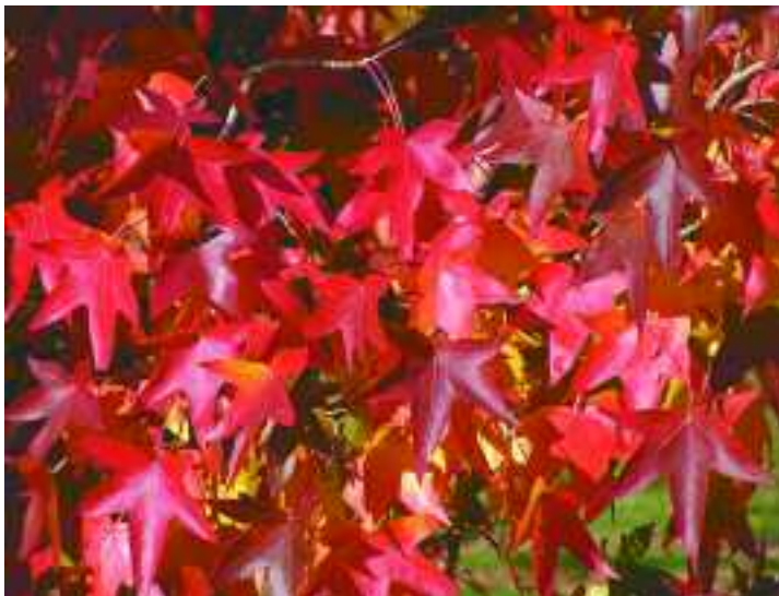
Moraine Sweet Gum

ZONE: 5 | HEIGHT: 55' | SPREAD: 25' Caliper: 1¼" | 2" | 2½" | 3" | 3½" | 4" | 4½"