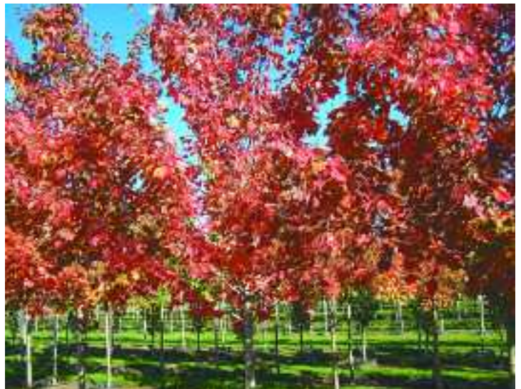
October Glory Maple

Caliper: 1¼" | 2" | 2½" | 3" | 3½" | 4" | 4½"